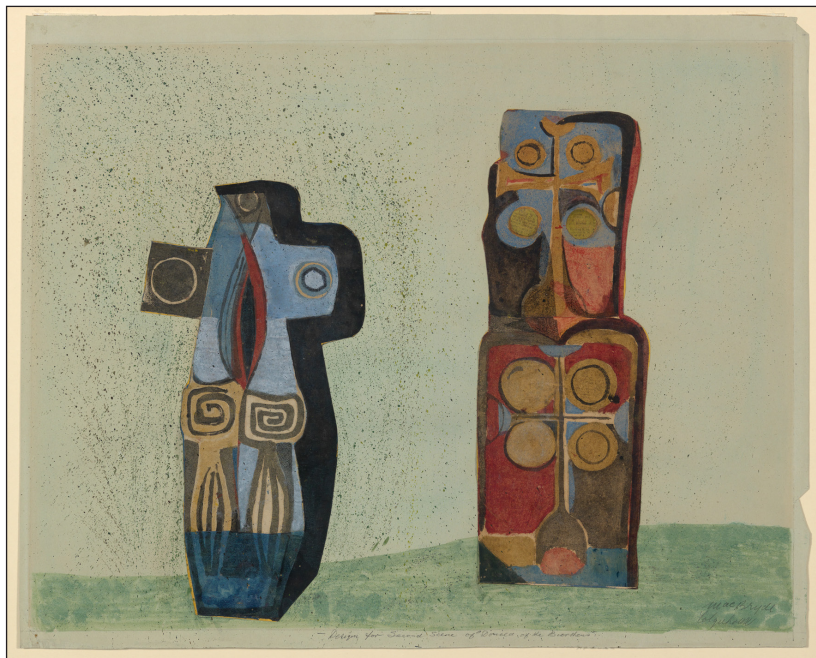
Figure 2: Robert Colquhoun and Robert MacBryde (1951) Design for Second Scene for Donald of the Burthens [collage, watercolour, ink, and gouache on medium weight, slightly textured, light green paper, sheet], Smith College Museum of Art, Northampton, Massachusetts.