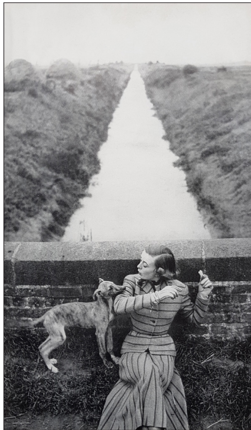
Figure 5: Henry Clarke (1952) Untitled, advertising photography accompanying J. Hawkes, 'Prospect of Britain', Vogue, February, p.61. Reproduced by permission of the copyright holder.