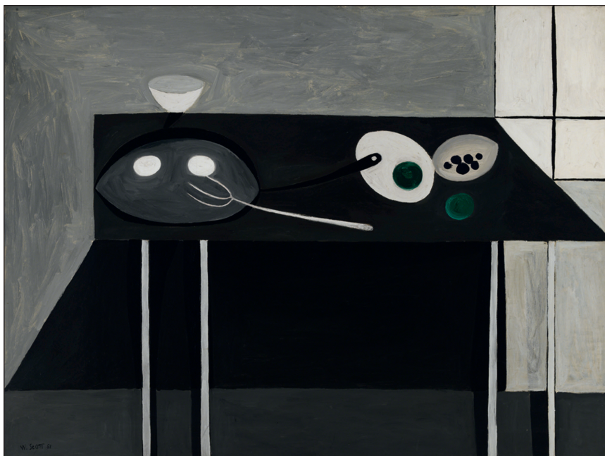
Figure 3: William Scott, Still Life (1951). © Estate of William Scott 2022. Reproduced by permission of the copyright holder.