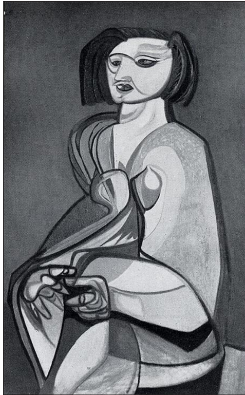
Figure 4: Robert Colquhoun (1951) Figure Painting .