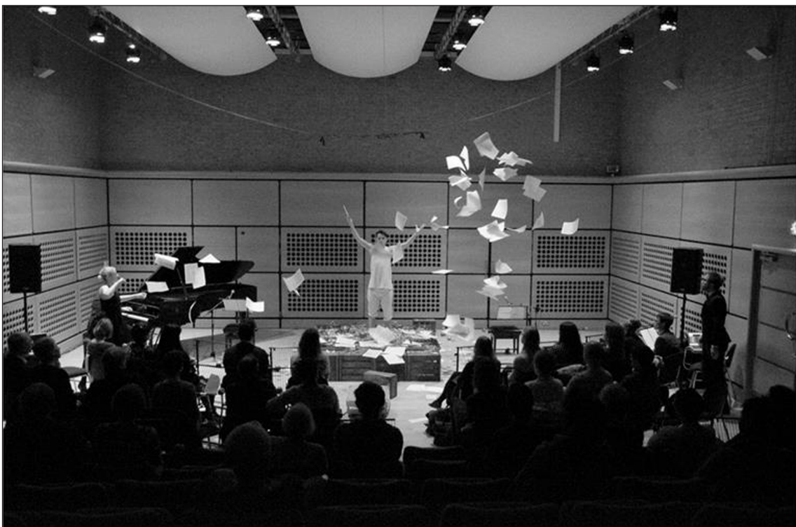
Figure 8: Concerto (Image credit: Julian Hughes). Reproduced with the permission of the photographer.

And this is how it ends... It ends with a final shared reflection on a methodology defined through the authors' music-centric practice in the making of contemporary performance. It ends with a reference to the rhizomatic and tacit relationship between musicology and dramaturgy in this kind of work. The writer, Moises Kaufman, describes