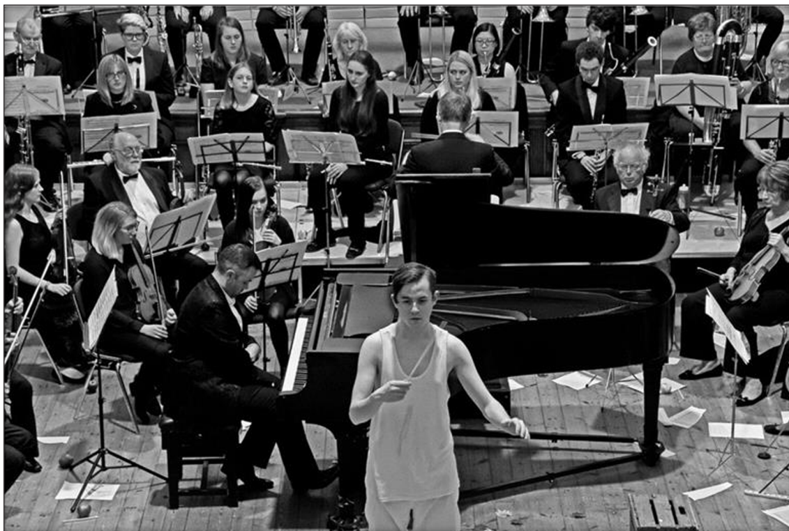
Figure 6: Concerto (Image credit: Julian Hughes). Reproduced with the permission of the photographer.