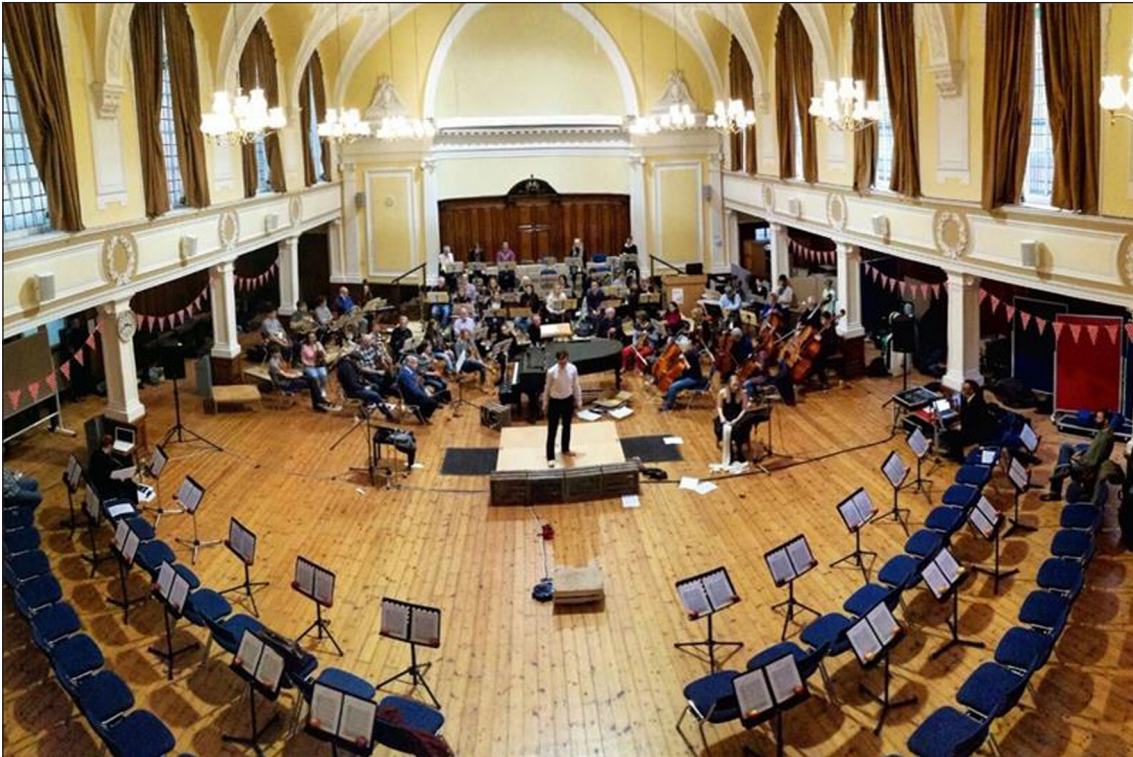
Figure 7: Concerto (Image credit: Julian Hughes). Reproduced with the permission of the photographer.

music have elapsed. Devising tasks involved how it ‘feels’ to be waiting to make an entrance and what may be happening in the body at that time and how it relates to performing.