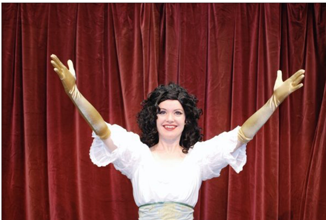
Figure 1: Traviata (Image credit: Plane Performance). Reproduced with permission of the company.