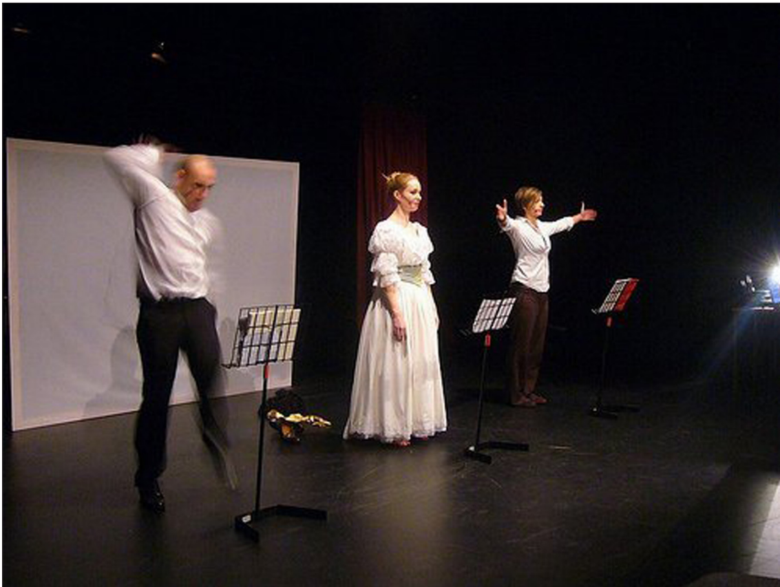
Figure 4: Traviata (Image credit: Plane Performance). Reproduced with permission of the company.

My translated scores help to re-structure the performance according to Verdi’s compositional choices, allowing for a re-assessment of the way in which the theatrical material functions and operates. The material the company generated was, in some ways, co-authored with Verdi, who served as what Roesner might call ‘a kind of co-director in [the] process and an omnipresent additional collaborator on stage’ (Roesner, 2008: 6). The company allowed the past and the present to sit side by side: a dialogue between a dead composer and a contemporary performance company. His written notation instructed and informed the project and gave them clues about how to perform or present the material; this material was then layered back over his score, added to it, and existed with it. In doing so, La Traviata haunts the performance of Traviata . These scores served to remind the company of the project’s relationship to Verdi’s music and to advocate for its use