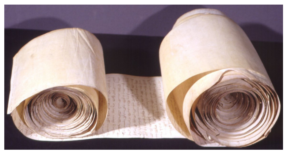
Figure 2: Parchment roll containing the preliminary phase of proceedings in the dispute between the abbess and convent of Lorvão and the cathedral chapter of Coimbra (1304–1306). Source: Lisbon, Arquivo Nacional da Torre do Tombo, Cabido da Sé de Coimbra, mç. 102, 2.ª incorporação, no. 1.

court proceedings themselves, which include procurations, court inquiries and witness depositions. From a material point of view, these records consist, as a rule, of individual folded-up parchment skins ( Figure 1 ) or parchment membranes stitched together and rolled up ( Figure 2 ), but they can also be found in miscellaneous cartularies, such as Braga cathedral's 16th-century Rerum Memorabilium ( Figure 3 ), or as part of ad hoc dossiers compiled with the purpose of documenting a specific legal dispute, such as the one that opposed, in the first half of the 14th century, the bishops of Porto and the kings of Portugal over the former's temporal jurisdiction over the city of Porto ( Figure 4 ).