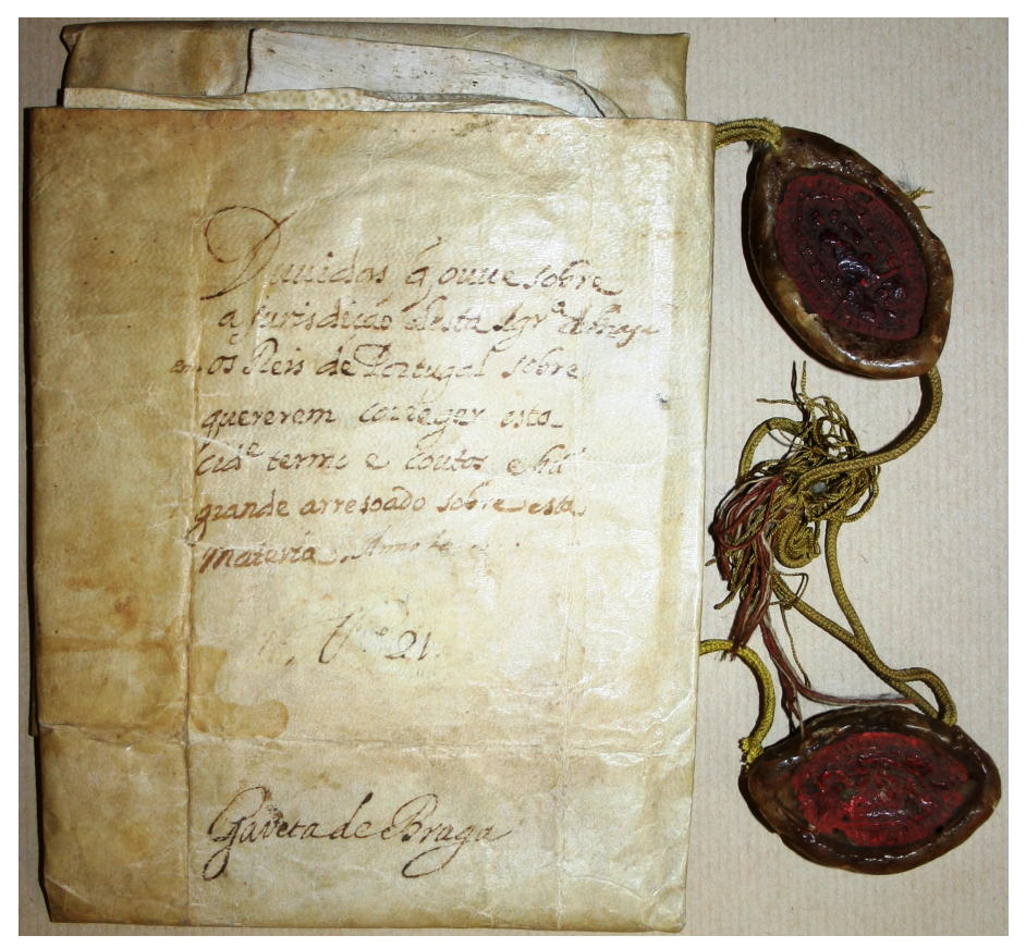
Figure 1: Legal consilium procured by the church of Braga in the first half of the 14th century.

What we are left with, then, is a documentary flotsam comprised of notarial copies of court proceedings, legal memoranda (that is, summaries of facts and legal arguments presumably drafted in the context of, or in preparation to, a legal action), inquiries, royal sentences, papal rescripts appointing judges delegate, legal consultations and so on. To these should be added the documents inserted in the