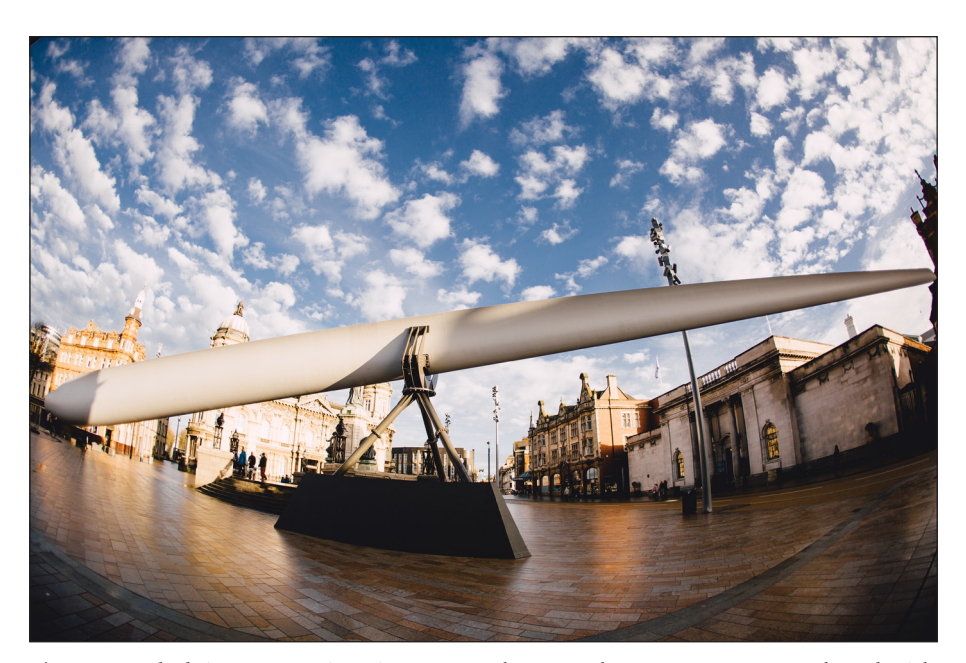
Figure 4: Blade in Queen Victoria Square.

I visited Blade in March 2017, on the last day of its residency in the city centre. It was an overcast afternoon, but even under a low, grey sky, Blade was a remarkable spectacle ( Figure 4 ). The turbine blades produced at the Siemens factory are cast by hand as a single piece of glass fibre-reinforced resin and balsa wood. The matte finish of the blade produced a peculiar optical illusion: even viewing the installation in person, it looked somehow superimposed or computer generated.