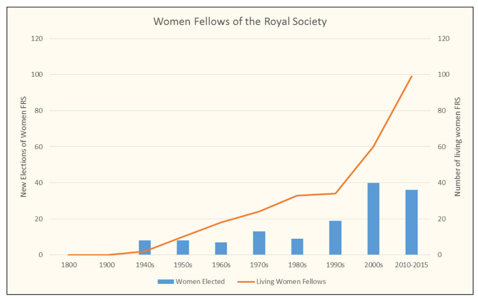
Figure 1: Women Fellows of the Royal Society.

As is well-recognised, however, the admission of Stephenson and Lonsdale did not mark the start of a flood of women into the Fellowship. As Figure 1 shows, there was steady but slow growth until the 1970s, and there has been a more recent phase of steeper growth since the 1990s. In 1955, there were just 10 women in the