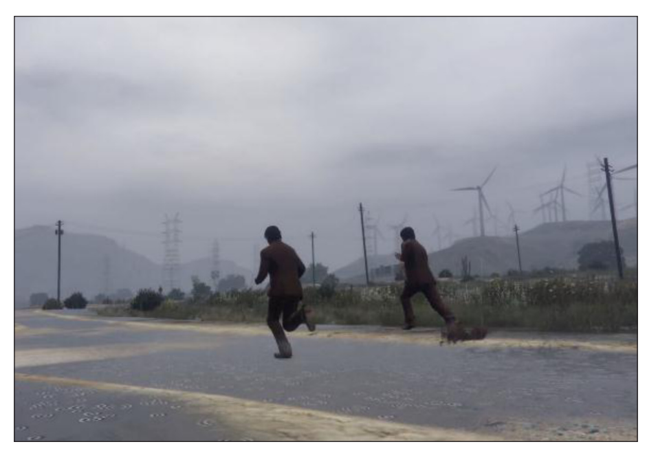
Figure 5: Achiampong and Blandy, Finding Fanon II, 2015, 02:51.