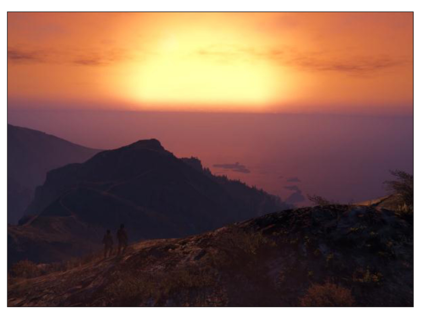
Figure 3: Achiampong and Blandy, Finding Fanon II, 2015, 03:10.

However, as becomes clear in what follows these scenes, this unhampered optimism only tells half the story and is undercut by the darker, more brooding characteristics of Frantz Fanon. David Macey (2010), Fanon's biographer, points to a 'fairly conventional dichotomy between a Fanon who was l'homme du refus ['the man who said "no"'] and a Fanon who asserted his loyalty to a new world' (Macey, 2010: 33). While Fanon's readers usually sided with one of these, Macey rightly holds that the