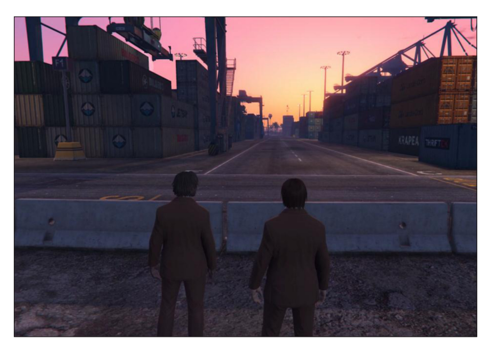
Figure 7: Achiampong and Blandy, Finding Fanon II, 2015, 05:23.

for the 'possibilisation' of his vision of radical decolonisation — which cannot find its realisation and release here. After all, such a release would amount to a disavowal of the traumas of ethnocentrism and racial violence that remain fundamental aspects, not only of GTA V, but of the social, material, political and economic realities to which the game refers and the foundations upon which it rests. Disoriented and stuck, their movements aimless, the protagonists of Finding Fanon II bring to the stage the core of Fanon's legacy: the way towards a utopian destination that just cannot find a realistic point of departure.