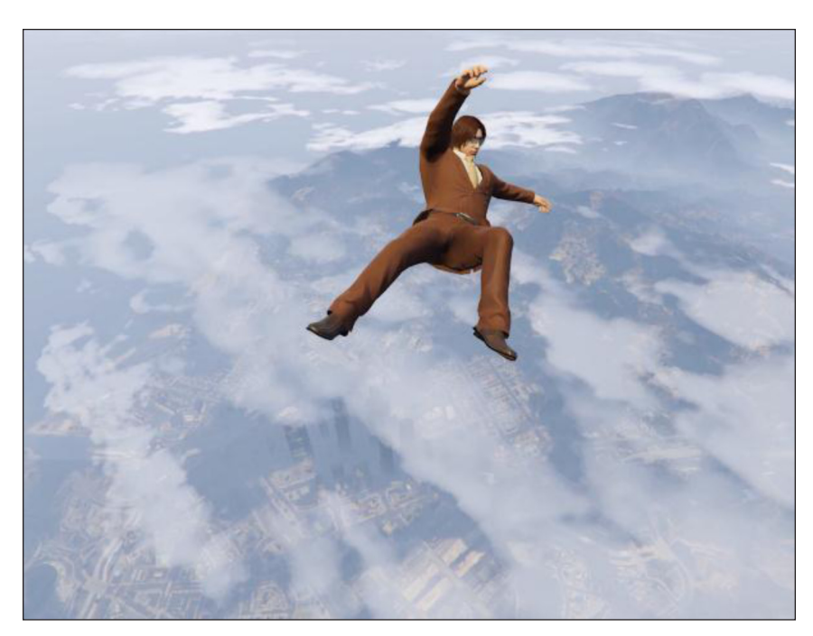
Figure 1: Achiampong and Blandy, Finding Fanon II, 2015, 00:07.9