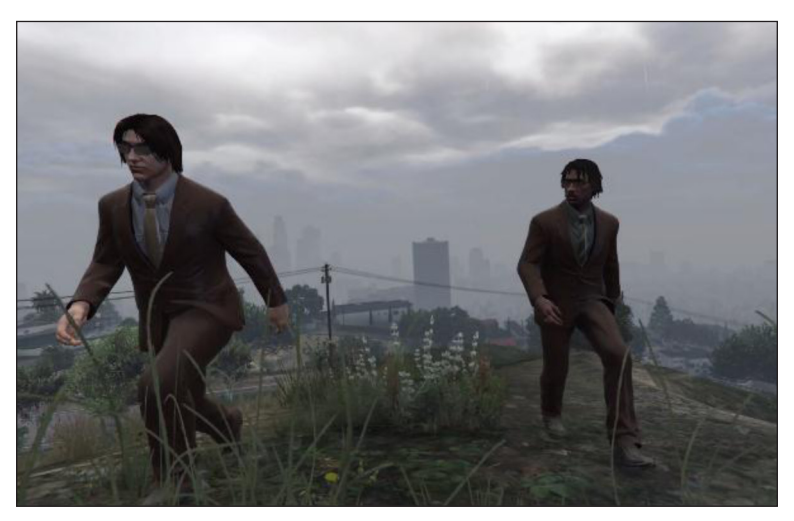
Figure 4: Achiampong and Blandy, Finding Fanon II, 2015, 02:20.

All their urgent, searching movements are punctuated by scenes of standing still, of facing each other and of looking out into the open sea; and what the narrator refers to as 'edges of the traversable world' (Achiampong & Blandy, 2015, 03:40), i.e. the limits that, in the context of the game, are the ends of the virtual, programmed platform. On a psychosocial plane, they are the limits of the thinkable, conscionable, imaginable and acceptable. Thus, as picturesque and impressive as the GTA game world proves in the film, what ultimately comes to the fore as is that there is no peace for the two men to be found here: their incessant walking, running and gazing out into the open articulating disquiet, restlessness and an uneasy search for Fanon – i.e.