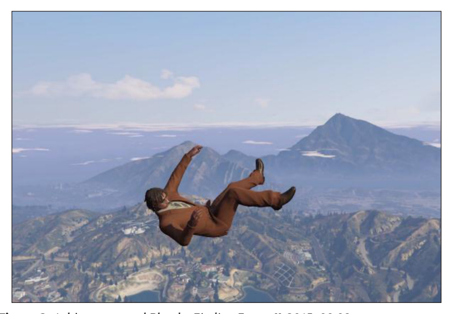
Figure 2: Achiampong and Blandy, Finding Fanon II , 2015, 00:09.