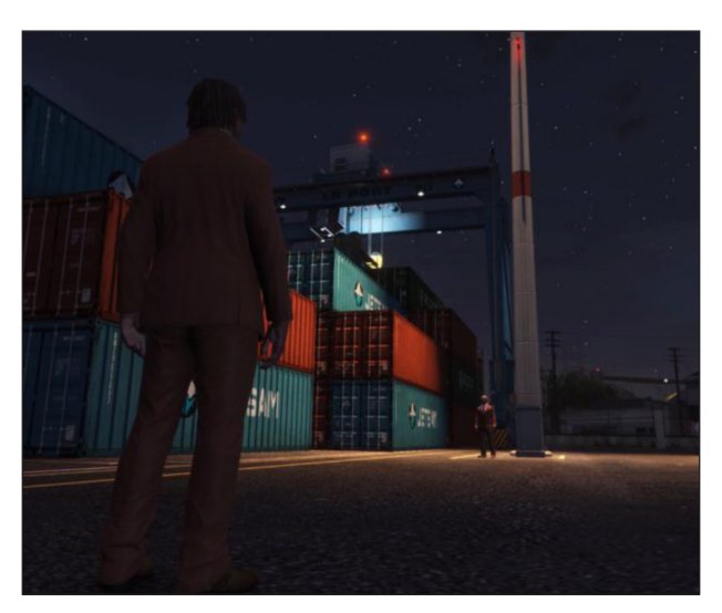
Figure 9: Achiampong and Blandy, Finding Fanon II, 2015, 06:09.

to GTA III that '[b]y bringing forth the stereotypes that are the player's, the player is granted opportunity to reflect upon them' (2005: 11). Tanner Higgin, in turn, sees the GTA series as offering variations of 'performative spaces wherein the player stages a fantasy that satirizes and demythologizes the outside world', claiming further that 'the player undergoes a becoming [...] which re-sensitizes her to the violent structures of the world in order to better understand and navigate them' (2006: loc. 1362). David Annandale, meanwhile, reads GTA: San Andreas as a 'subversive carnival' and CJ as the 'carnival king', claiming that 'the denunciations from on high' that GTA: San Andreas in particular received, 'grant the game the very powers the hegemonic forces fear' (2006, loc. 1919). The list could be continued. What is important here, though, is Finding Fanon 's stance towards this vision of the liberational effects of irony. By evoking, yet ultimately refraining from enacting the game's racialised forms of interaction, the artwork implies that, no matter how carnivalesque the attempt at their subversion, they will remain toxic and should simply be avoided.