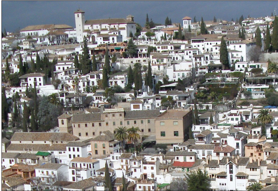
Figure 3: The Albayzín seen from Alhambra. Note the crowd on San Nicolás square, below the church spire on the upper left side. To the right we can see the shorter minaret of the Great Mosque.

heritage discourse' regarding the Albayzín. It is hard to fathom in retrospect the fears voiced by locals back in 1993, that 'the construction of the mosque might have a negative effect on UNESCO's decision to declare the neighbourhood as World Heritage' (Rosón Lorente, 2008: 409). Such concerns were proved unfounded only a year later. The positive decision also disproved the residents' claim that 'the neighbourhood is known for its peasant-Gypsy [ payo-gitano ] ancestry, and the Muslim connotation it might acquire would not be true' (Rosón Lorente, 2008: 408–9). From the perspective of heritagification, the existence of a mosque in what presents itself as a Moorish district brings added value even if the edifice itself is newly built and bears no historical significance.