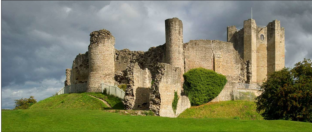
Figure 1: View of Conisbrough Castle featuring the polygonal keep.

Conisbrough through Isabel's de Warenne inheritance, these two elements are telling of an attempt by the couple to celebrate their Plantagenet roots.