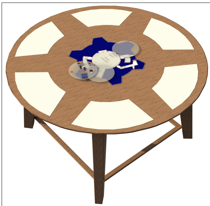
Figure 11: Proposed additions for the tabletops housed in the Conisbrough Castle keep. Roundels that are transparent and imply the adding of archaeological layers and objects over time. Designed by: Whitney McMakin, ISCO LLC, who has given permission to use this image.