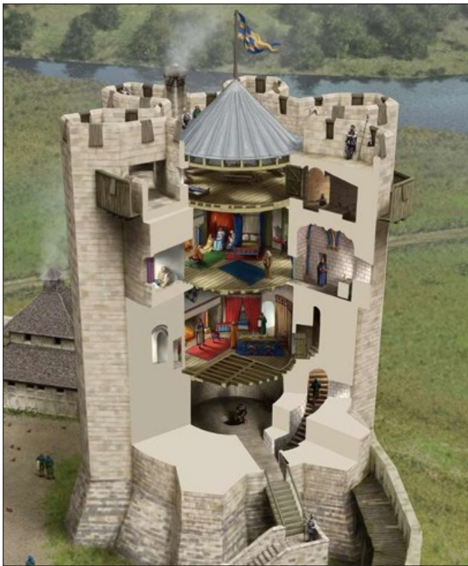
Figure 7: Two-dimensional representation of the keep in the EH Guidebook.

better visualize what the now empty space looked like for the former residents. In comparison to the suggestion to add new characters, this method of engagements and extending education will allow guests to move more freely after only one character narrative. Furthermore, should the idea of added projection detract from the natural atmosphere of the castle, a QR code could be utilized for a web-based visualization of each floor of the keep. 7 With images of the domestic objects either physically located on site or projected on display, guests can better imagine the domestic surroundings of