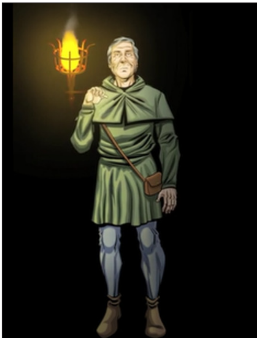
Figure 4: Character projection of Otes de Tilly, the steward of Conisbrough Castle during Hamelin and Isabel's residency.