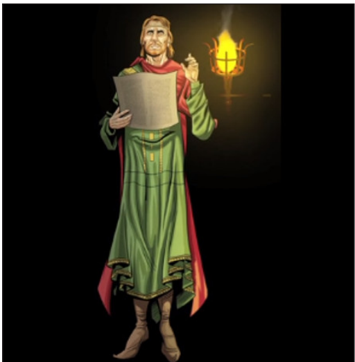
Figure 5: Character projection of Lord Hamelin.