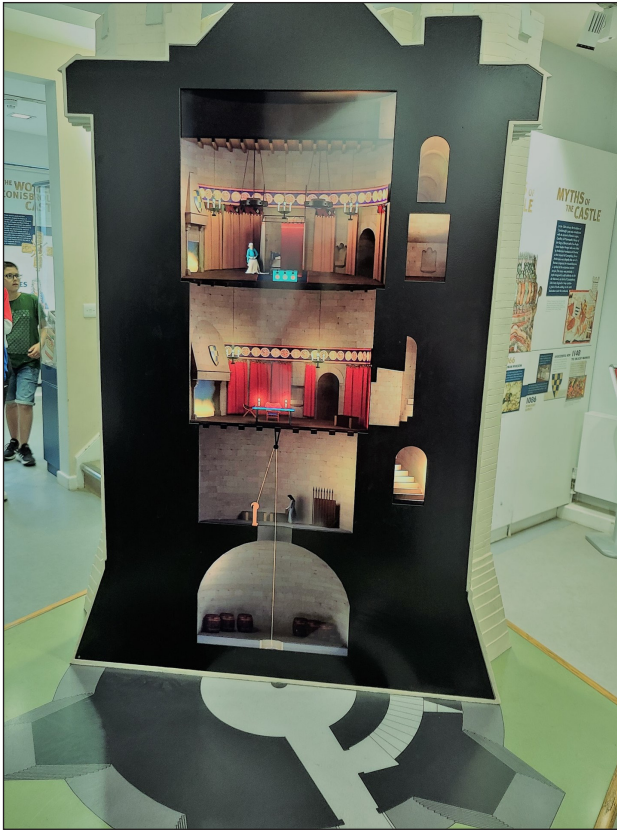
Figure 8: Three-dimensional model of the keep housed in the gallery at Conisbrough Castle. The keep is in the round but features a flat screen where each room is represented. Photo: taken by author in 2022, shared with permission from heritage managers at Conisbrough Castle and English Heritage.

first through its physical possibilities, the roundels will then attract through their visual attributes. The acrylic layers can be backed with a solid color ( Figure 10 ) to denote a new time period per layer, or remain clear so that through the ages, more objects are added to the room ( Figure 11 ). Using clear acrylic would add to the viewer experience the idea of layers of recovery in an archaeological excavation, a process certainly celebrated at Conisbrough and by EH. Should the acrylic roundels have backing, text with historic details could be added, summarizing each resident in a few sentences or bullet pointed facts. As is indicated in the provided rendering, an addition such as this would create a