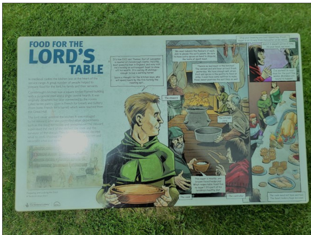
Figure 3: Story boards in the bailey at Conisbrough Castle.

The keep is the main appeal to Conisbrough Castle. Upon climbing the newly constructed stairs, guests enter the first floor of the keep and are greeted by a video projection of a character on the wall opposite the entry. Complementing the style of the story boards in the bailey, the projections on floors one, two, and three represent the de Warenne steward, Lord Hamelin, and Lady Isabel in ascending order ( Figures 4–6 ). Each projected character introduces themselves to the audience and presents their role in the castle in conjunction with an assumed personality. As the floors of the keep are relatively small, time before or after watching the projections can be used to investigate the special features of the space, including the chapel, the latrine, and the more detailed architectural elements. Activity tables are centrally placed on floors two and three of the keep, each of which is equipped with an inlaid blueprint of that floor and encircled by ‘fun facts’ about the space and people during the de Warenne residency. As these interactive elements are already in place, it would be most cost-effective to enhance the space and progress the castle’s narrative with these pedagogical methodologies.