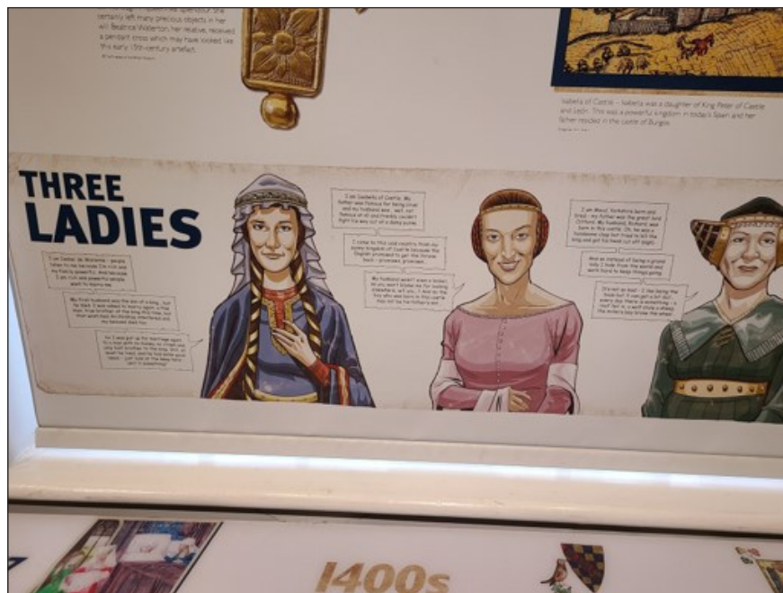
Figure 12: Signage featuring the “Women of Conisbrough” in the gallery timeline.

site would surely enhance the visitor understanding of life at Conisbrough Castle across time. Such an expansion and clarification could also help visitors learn to celebrate female historical figures versus make light of them. Increasing representations of women aligns with the Savage and Wyeth’s goals for EH updates, but at Conisbrough the concern is perhaps for the type of representation versus a lack thereof. Using the existing tabletop spaces and projections in the keep, and even by simply updating the text on the gallery signage, the women of Conisbrough and their contributions to their home and their broader society can be better recognized.