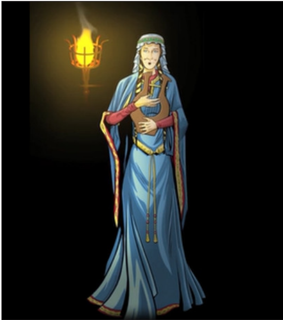
Figure 6: Character projection of Lady Isabel.

of Conisbrough as a home over the centuries and how it was a setting for multiple families' triumphs and tribulations.