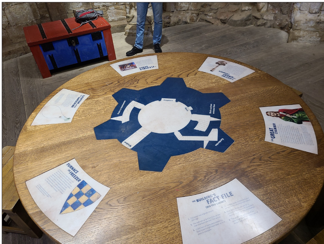
Figure 9: Interactive tables located in the center in each floor of the keep.

tactile feature in the room for those seeking an interactive experience. My proposal for changes is simply theoretical, but in lieu of paper hand-out activities or the introduction of e-games, this option is a one-time investment that will not require reprint or electronic updates and conveniently builds on what is currently in place. As these proposed options utilize interactive systems already at the location, they are perhaps not too far of a reach should EH wish to build on Conisbrough's narrative in future site updates. Educating through experience and through touch would align Conisbrough Castle with Sheldon's approach of learning through enjoyable engagements.