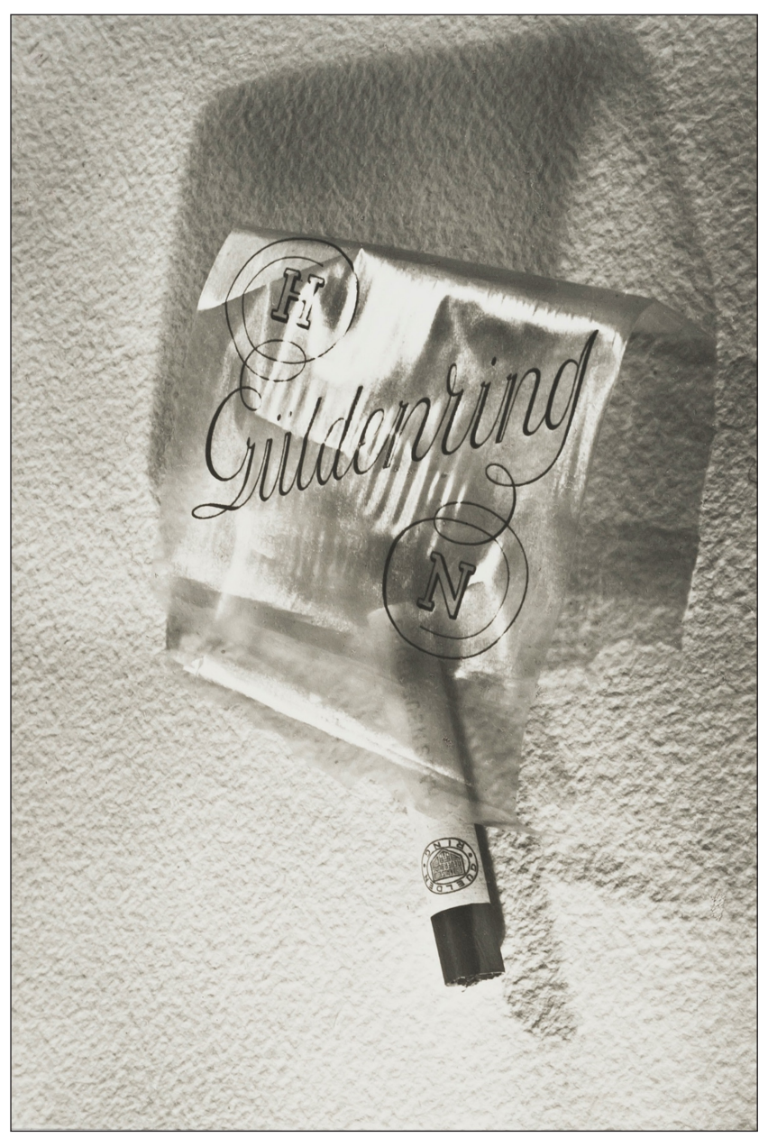
Figure 3: ringl + pit (Ellen Auerbach and Grete Stern). Güldenring Cigarettes , 1931. The Jewish Museum, New York / Art Resource, NY. Accession Number: 2017–27.11. Courtesy of Robert Mann Gallery. © Robert Mann Gallery.

were neutral, but cigarettes were also marketed to both sexes where either a man or a woman, or even a happy couple, would be featured as main actors in a scenario of leisurely enjoyment punctuated by the pleasure of smoking. Of those advertisements containing only women, a similar formula of seduction to that seen in the Bemberg advertisement is prevalent.