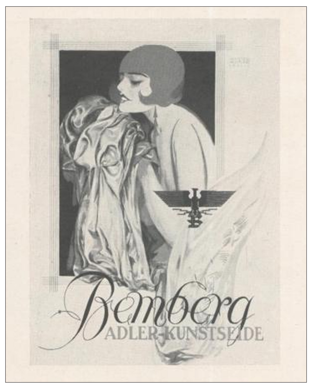
Figure 2: Werner von Axster-Heudtlass. Advertisement for Bemberg fabrics, 1927. Published in Gebrauchsgraphik vol. 4, no. 11 (1927), 62. Patrick Roessler Archive of the Illustrated Press, Erfurt, Germany. Arthistoricum.net. Public domain.

fabrics ( Figure 2 ). This illustration features the lithe figure of a young woman cropped at the waist and framed by a black rectangle edged by thin parallel lines that crosshatch at the corners in a decorative border. Her hair is a smooth cap of negative space as though her bobbed hairstyle [ Bubikopf ] has been cut out of the image. Her heavily