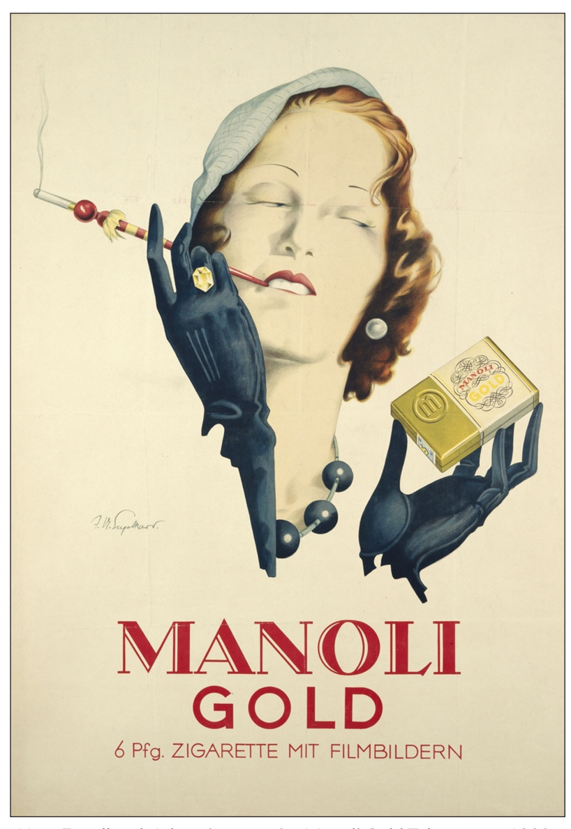
Figure 4: Julius Ussy Engelhard. Advertisement for Manoli Gold Tobacco, ca. 1930.

A contemporaneous example is an advertisement for Manoli Gold, which shows the depiction of a glamorous and beautiful woman smoking ( Figure 4 ). The image is once again an illustration showing the head, neck, and gloved hands of a bejeweled woman. She has short, curled hair worn under a hat, and she holds a long, red and yellow cigarette holder to her mouth, its opposite end filled with a smoking cigarette. Her other gloved hand holds aloft a closed package of Manoli Golds, and she gazes down at this, her eyes almost entirely closed in apparent pleasure. Luxury is suggested by the name of the product (gold) and by the obvious wealth of the woman smoking.