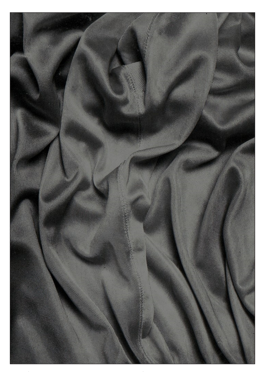
Figure 1: ringl + pit (Ellen Auerbach and Grete Stern). Artificial Silk from Maratti , 1931–1930. The Jewish Museum, New York / Art Resource, NY. Accession Number: 2017–27.4. Courtesy of Robert Mann Gallery. © Robert Mann Gallery.

When viewed as a totality, the choice of images, titles, and Schalcher's avoidance of placing the photographers in the context of their peers or of mentioning any specifics of their profession suggests that they are women photographers who work with traditionally feminine subjects and who use their feminine wiles and intuition to set themselves apart in the realm of photography. The sexism of Schalcher's compliment ignores the Bauhaus and New Objectivity [Neue Sachlichkeit] aesthetics from which ringl + pit's style was formed, as well as the acerbic wit so redolent of Weimar's female