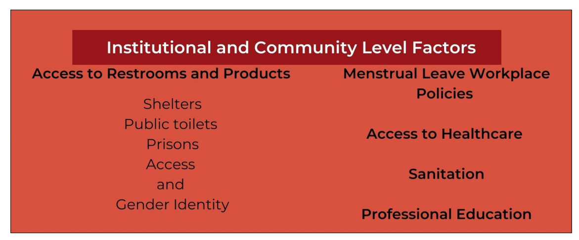
Figure 4 : The institutional and community level factors discussed in this paper. Text by the author, image by Canva.

The institutional and community level includes structures and institutions such as healthcare and restroom facilities, schools, and community level sanitation programs (CDC, 2020). In this review, menstrual leave, access to toilets, and menstrual products are all factors related to this level of the SEM and are visually represented in Figure 4 .