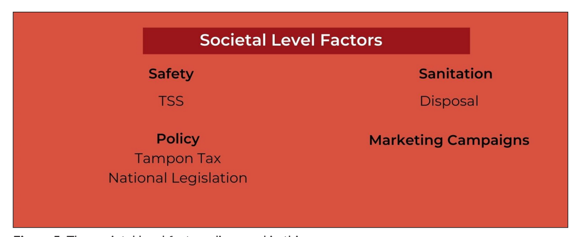
Figure 5: The societal level factors discussed in this paper.

The societal level includes topics such as policies, procedures, laws, and campaigns related to menstruation (CDC, 2020). In Scotland, menstruation has been a topic of conversation closely related to safety, sanitation, as well as a campaign for free menstrual products. In the US, campaigns have centered more around the taxation of menstrual products (Weiss-Wolf, 2020), as well as a push for the provision of free menstrual products, which has been proposed in Congress, but has not yet passed (Meng, 2017b; Meng, 2019). These topics are visually represented in Figure 5.