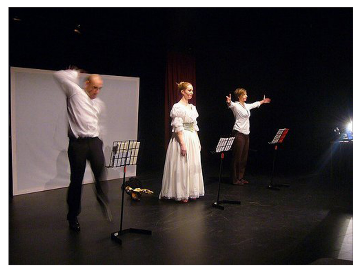
Figure 4: Traviata (Image credit: Plane Performance). Reproduced with permission of the company.

My translated scores help to re-structure the performance according to Verdi's compositional choices, allowing for a re-assessment of the way in which the theatrical material functions and operates. The material the company generated was, in some ways, co-authored with Verdi, who served as what Roesner might call 'a kind of co-director in [the] process and an omnipresent additional collaborator on stage' (Roesner, 2008: 6). The company allowed the past and the present to sit side by side: a dialogue between a dead composer and a contemporary performance company. His written notation instructed and informed the project and gave them clues about how to perform or present the material; this material was then layered back over his score, added to it, and existed with it. In doing so, La Traviata haunts the performance of Traviata . These scores served to remind the company of the project's relationship to Verdi's music and to advocate for its use