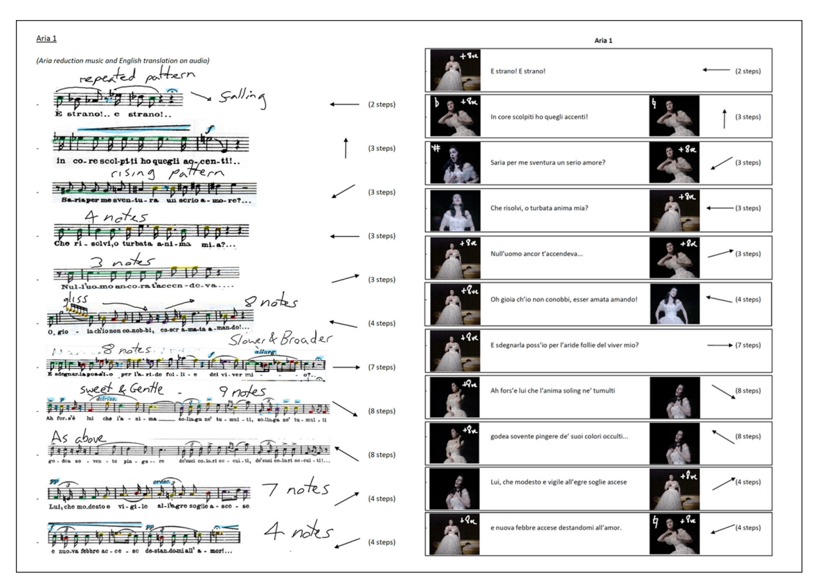
Figure 5: Traviata Violetta Aria 1. Prepared by Kevin Egan. Reproduced with permission of the author.

As can be seen in Figure 5 , the performance score for these arias bears little resemblance to the operatic score from which the material is structured, yet the arias nonetheless follow a set of rules that are governed by the source text. In my score I used seven images from a filmed performance of the aria, which showed a range of facial expressions and postures of the singer playing Violetta, and these were arbitrarily assigned to the seven main notes of the scale. The pitches at the beginning and end of each musical phrase in the aria were used to identify which 'note-images' were to be included in my performance score. The images were then annotated to distinguish whether those notes were an octave higher and/or sharpened or flattened according to Verdi's original notation. These differences were represented in the performance by small shifts in the performer's re-creation of the note-images, such as the raising and lowering of the body or the direction of their gaze. The trajectory of the musical phrase (rising, falling or returning to the same note) was also used in the first aria to indicate the direction of travel that performer Anna Fenemore took; the number of bars for each phrase dictated the number of steps along the path.