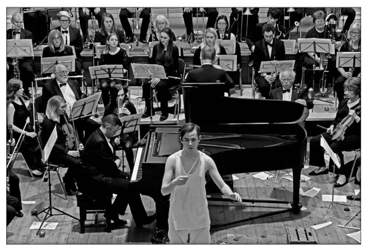
Figure 6: Concerto (Image credit: Julian Hughes). Reproduced with the permission of the photographer.