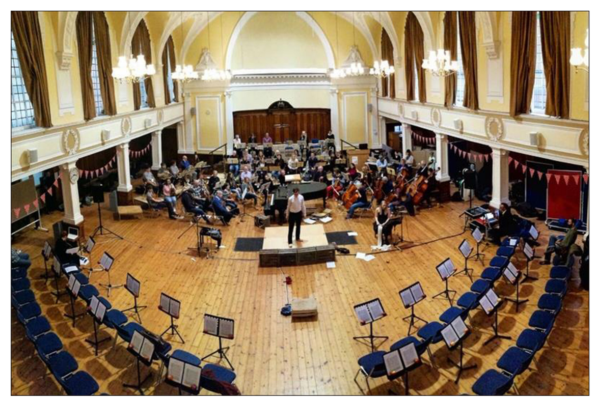
Figure 7: Concerto (Image credit: Julian Hughes). Reproduced with the permission of the photographer.

music have elapsed. Devising tasks involved how it 'feels' to be waiting to make an entrance and what may be happening in the body at that time and how it relates to performing.