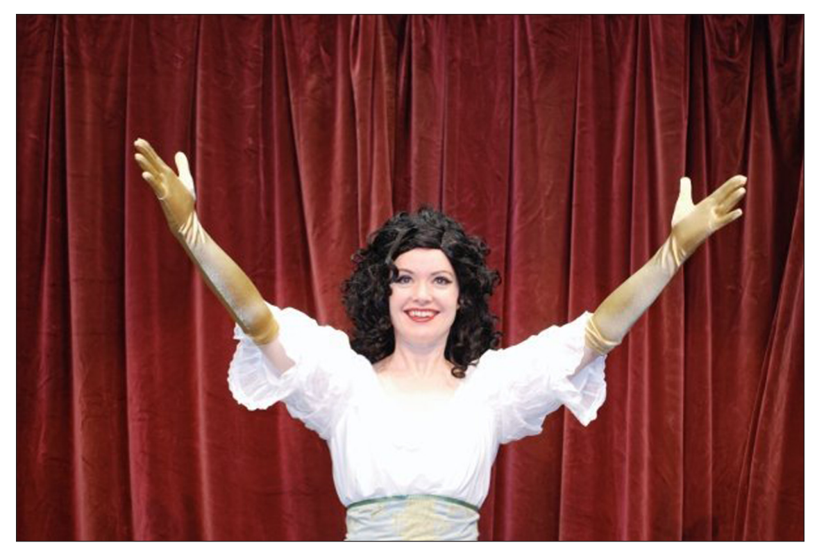
Figure 1: Traviata (Image credit: Plane Performance). Reproduced with permission of the company.