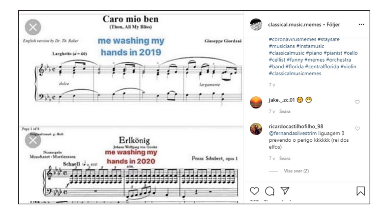
Figure 3: Washing hands in 2019 compared to 2020. classical.music.memes 2020 'Me washing my hands', Instagram. 14 March.

The use of notation as a graphic way to describe non-musical phenomena is a recurring theme in classical music memes. Sheet music, not surprisingly a common feature in classical music memes, can be used to comment on social structures within