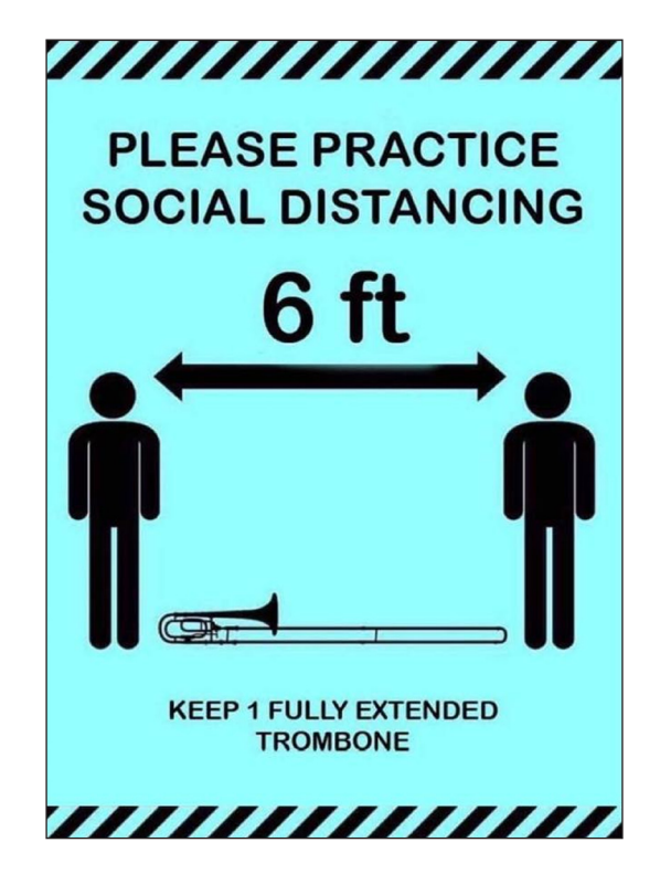
Figure 4: Social distancing using trombones. Classical Music Humor 2020a 'Please practice social distancing', Facebook. 15 June.

Hygiene and distancing recommendations are thus in various ways brought into the language of classical music memes. Even if the primary aim of these memes is to entertain, they also disseminate health information. The fully extended trombone (please see Figure 4 ) or hand washing to 'An die Freude' work as 'translations' of health information from a public health discourse – that is, an objective, informative and not very entertaining tone – to a classical music meme discourse where entertainment is pivotal and, like much other humour, arises from the clash between different discourses.