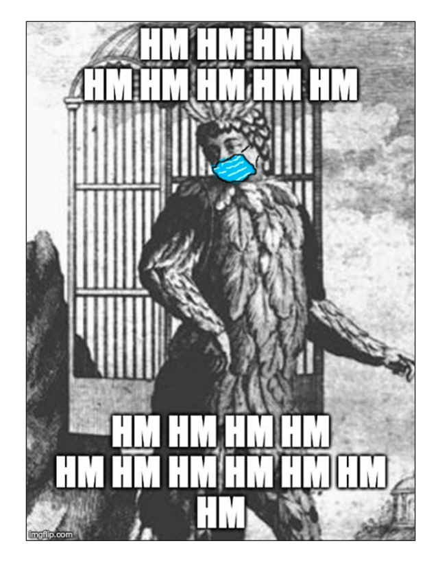
Figure 1: "Papageno in 2020". u/zchwalz 2020 'Papageno in 2020', Reddit. 26 May.

This picture (see Figure 1 ), based on the original print of the libretto to Die Zauberflöte , and portraying Emanuel Schikaneder in the role of Papageno, was added by user zchwalz to the subreddit 'r/ClassicalMemes' on 26 May 2020 with the caption 'Papageno in 2020' (u/zchwalz, 2020). The overt message is, in a way, simple: due to face mask regulations, a song will sound very different, more like humming perhaps. However, to interlocutors with further subject competence, this meme suggests other