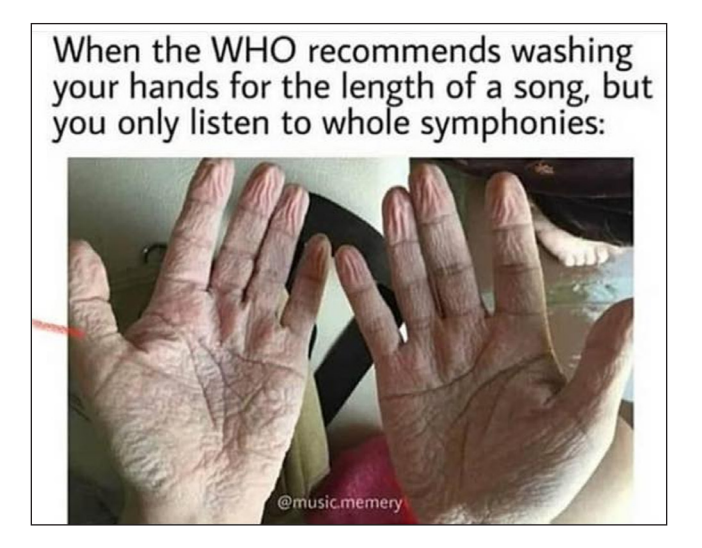
Figure 2: Hand washing to whole symphonies. Classical Music Humor 2020b 'When the WHO recommends washing', Facebook. 17 April.