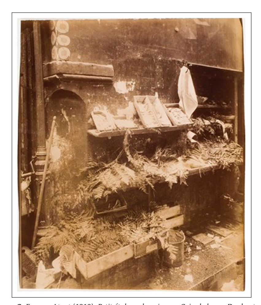
Figure 2: Eugene Atget (1910), Petit étalage de poissons, Coin de la rue Daubenton et de la rue Mouffetard, Paris.

Evans photographs, taken in the context of the BSC stockyard, arguably portray a subject and atmosphere more similar to early surrealist photography, notably French photographer Eugène Atget's photographs of Paris taken at the turn of the 20<sup>th</sup> century. Walter Benjamin famously described these same photographs as 'remarkable for their emptiness.' 'The city in these pictures,' Benjamin continues, 'is empty in the manner of a flat that has not yet found a new occupant.'