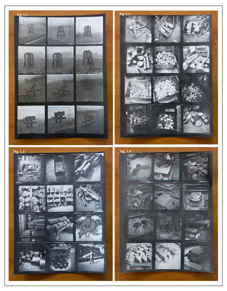
Figure 1: 1.1, 1.2, 1.3 and 1.4 Garth Evans (1971), Contact Sheets, Henry Moore Foundation Archive. Reproduced with permission from Garth Evans, David Cotton and courtesy the artist/Leeds Museums & Galleries (Henry Moore Institute Archive of Sculptors Papers).

Evans' photographic framing isolates these objects from human and mechanical activity.<sup>42</sup> Significantly, he chooses not to capture the act of learning or more accurately training within the corporation but, instead, captures its aftermath, its debris. Evans' choice of composition presents a ghostly portraiture that draws many parallels with Carl Andre's photographs of found sculptures from 1960/61. However,