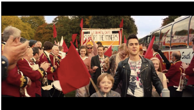
Figure 3: Tradition giving way to change, defeat transforming into victory (screenshot from DVD).

When the film opens the strike has already been ongoing for four months, with Mark watching news of its progress on TV. Its place on the news establishes its public importance as it also suggests our distance from it, and identification instead with the perspective of Mark, and by extension, LGSM. Thus the different temporalities of the film are layered so as to identify the miners with tradition and the past, and LGSM with change, and therefore the present—not solely the present of the film's action but eventually that of the viewer. The film's temporal dynamics stage the supersession of the legacy of socialist culture by a politics based more in