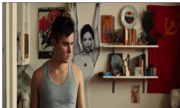
Figure 2: Subcultural bric-a-bric in Mark's flat. Screengrab from the film.

Typically for a period film, Pride seeks to faithfully recreate the past within dramatic situations that bring awareness to time's acute presence. The main character Joe's introduction is based around such awareness; he stares at the clock anticipating getting away from home, meets the support group in a chance encounter and decides to collect alongside them as he stops worrying about catching the last train. Later, Dai nervously awaits the arrival of LGSM at the village hall in a parallel example of anxious clock-watching. The film takes place over a year, and begins on Joe's birthday, while its climactic scene sees him leave home on his nephew's christening celebration. When Steph hears he is only 20, she jokes 'victory to the minors!', which is not solely a play on words, but another temporal layering—for not only must Joe