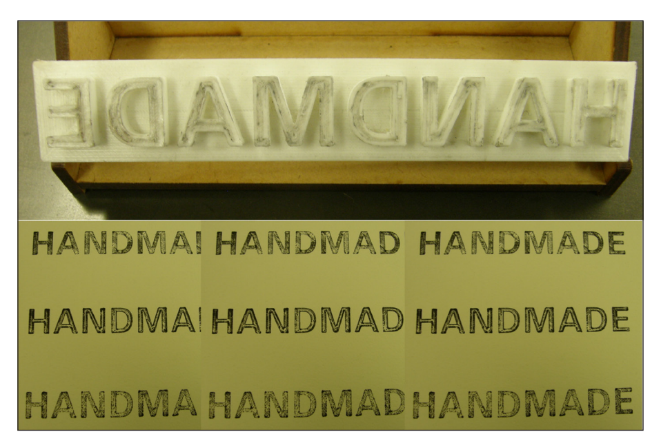
Figure 8: Digital Handmade: 3-D printed logotype block and analogue letterpress prints.

Artistically, Unexpected Connections is also a potent canvas for exploring what we term at Wai-te-ata Press the 'digital handmade' (Shep & Browning, 2018) (see Figure 8 ).