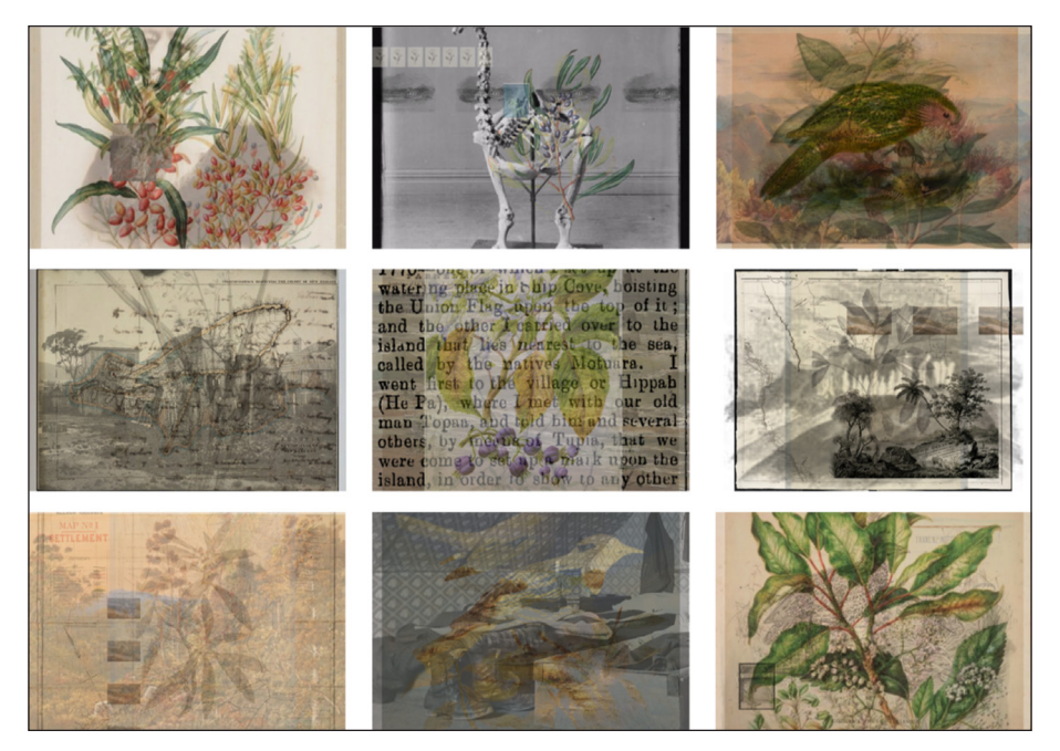
Figure 10: Palimpsests from Unexpected Connections.

Such a balancing act of presence and absence is the fulcrum of storytelling. As museum historian Maria Zytaruk (2011) notes, collectors transformed the cabinet from a storehouse of static objects to a dynamic visual tool for creating, organising, recording and preserving knowledge. They also compiled catalogues, talked about objects in their letter correspondence, shared their cabinets with like-minded collectors and deeded their collections to posterity. These dynamic spaces of knowledge-making and knowledge brokering – what David N. Livingstone (2005)