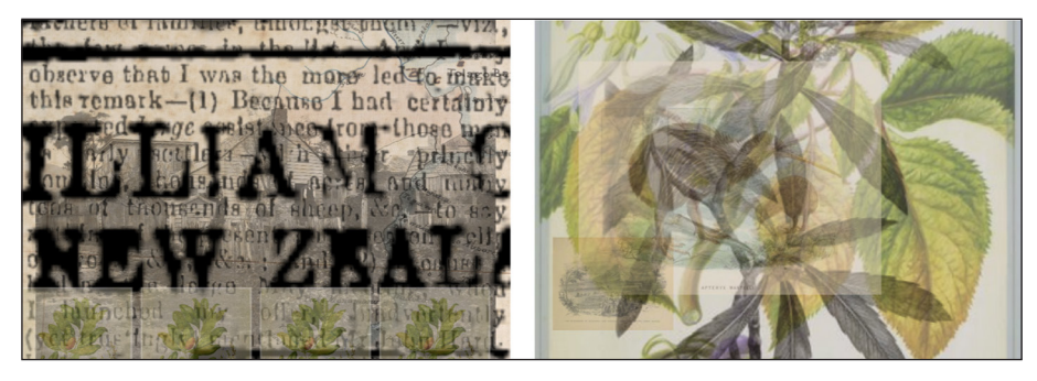
Figure 9: Palimpsests from Unexpected Connections : [left] with Papers Past newspaper content; [right] without Papers Past .

Moreover, this unintended recalibration meant the process of interrogating the spatial relationship between foreground and background made visible the epistemic nature of the project and emphasised the storytelling objective: how do we view the world and how much do you need to know to make sense of each multilayered canvas? This, in turn, led to further speculation about the role of randomness in a tuned system, the location of digital assets in our model of situated knowledges and