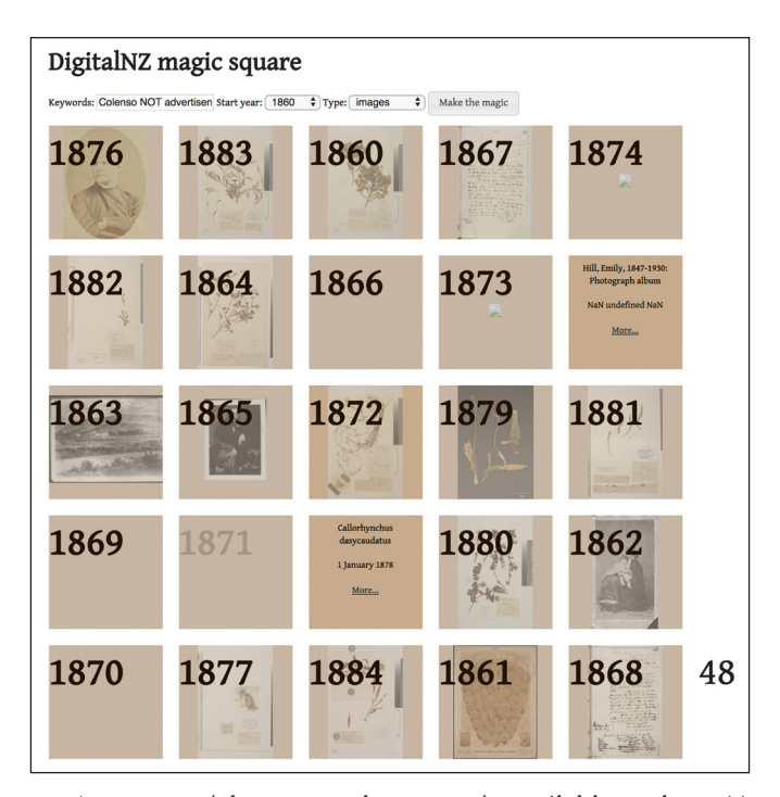
Figure 7: Magic Squares. (Sherratt & Shep, 2012). Available at: http://wraggelabs.com/shed/magicsquares/.

Technically, in our next development phase, saved images will be able to be user-curated, shared and dynamically re-generated through persistent identifiers whose metadata replay the composition engine and replicate each image. Stories both unsolicited and commissioned arising from the palimpsests will be published online to generate and sustain a community of reflective practice. Furthermore, we are experimenting with incorporating a different kind of serendipity tool to select the digital images that generated the Unexpected Connections palimpsests. Conceptualised by Shep and developed by Australian digital historian Tim Sherratt in 2012, Magic Squares (see Figure 7 ) is based on an ancient Chinese predictive tradition that was popularised by printers like Benjamin Franklin and, in New Zealand, Robert Coupland Harding. It also forms the basis of combinatorial number games such as sudoku with its permutations structured by a sequence of delimited mathematical variables.