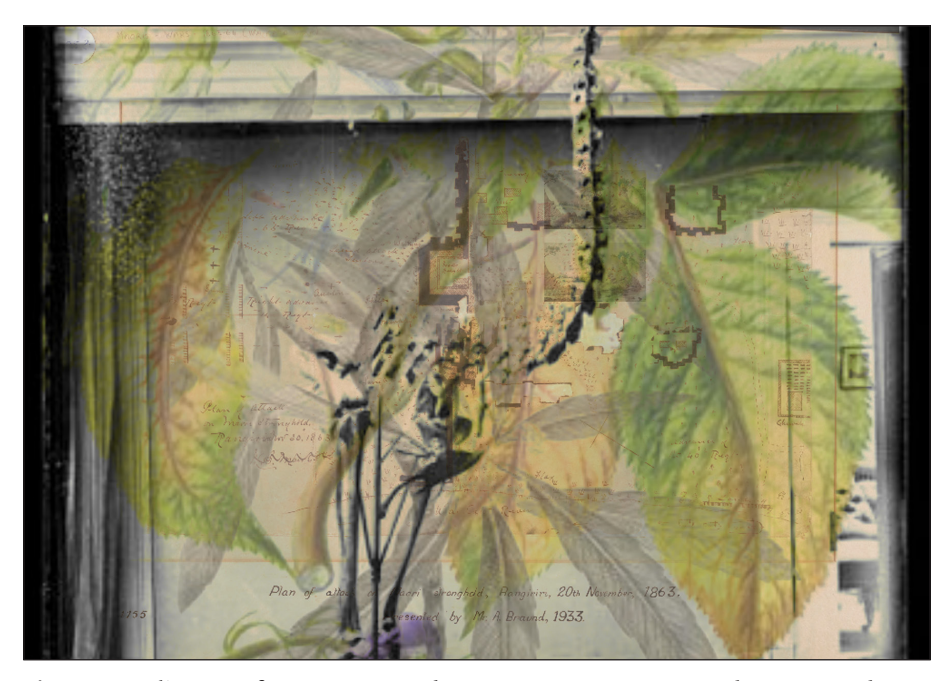
Figure 6: Palimpsest from Unexpected Connections: Reimagining the Nineteenth Century through Generative Art.

Critically, it reframes the generative experience as one which combines serendipity and palimpsests in the service of digital biography and user-initiated locative storytelling. It may have precursors in the theoretical fictions and montages of Aby Warburg's Mnemosyne Atlas or the restless collages of Walter Benjamin's unfinished Arcades project, but it shifts temporal chronology into spatial, episodic engagements and thus interrogates the concept of deep time in the age of the anthropocene. It also instantiates Manuel DeLanda's idea of non-linear history (1997) by foregrounding his reworking of Deleuze and Guattari's assemblage theory, in particular, his unpicking of the 'diagram of an assemblage' (2016: 5, italics original) in the context of genetically-driven and historically-informed speculative realism: