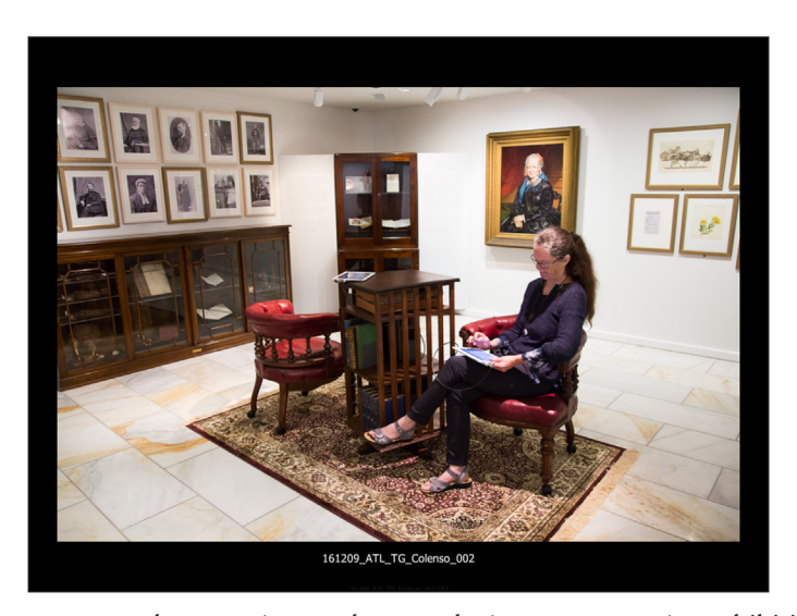
Figure 2: Unexpected Connections: Colenso and His Contemporaries. Exhibition view, Turnbull Gallery, National Library of New Zealand, Wellington, 14 November 2016–9 March 2017.

We staged the exhibition experience using the popular Victorian aesthetic and knowledge-building platform of the Wunderkammer, or 'cabinet of curiosities'. This choice of design reflected Colenso's own collecting practices, his contribution to building the Hawkes Bay Philosophical Institute's exhibition rooms and the place of nineteenth-century industrial exhibitions in attesting to 'the circulation of ideas and practices and to the power of the visual in carrying knowledge across borders' (Macnab et al, 2013: 769). Moreover, this aesthetic put storytelling at the heart of a user-generated interpretive experience. The gallery itself was turned into a cabinet of curiosities with objects displayed in period furniture (see Figure 2 ). At the centre of the exhibition space was a Persian carpet, two vintage pin-tucked leather wing chairs and a revolving bookcase with a selection of nineteenth-century books and periodicals as well as two iPads preloaded with the Unexpected Connections artwork.