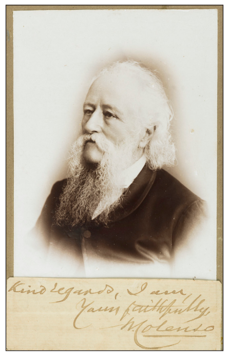
Figure 3: William Colenso, carte de visite, ca.1880.

As with many Victorians, Colenso (see Figure 3 ) was a man of prodigious talents: printer of te Tiriti o Waitangi (The Treaty of Waitangi, New Zealand's