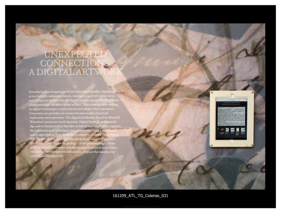
Figure 5: Exhibition installation of Unexpected Connections: Reimagining the Nine- teenth Century through Generative Art.

Unexpected Connections composes multi-layered images randomly drawn from a curated collection of some three hundred and fifty digitised objects related to Colenso and his contemporaries (see Figure 5 ). These objects are gathered together into DigitalNZ