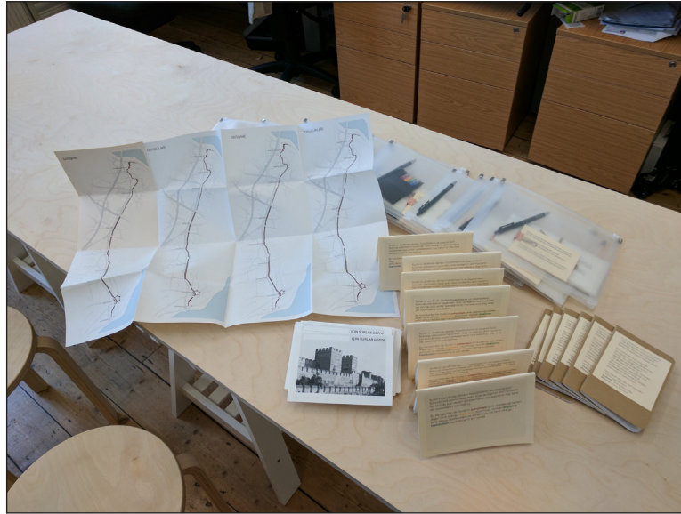
Figure 2: Part of the complete set of cultural probes.

mentioned that in the course of conducting our interviews we encountered a number of factors which suggested the value of these probe activities in conceptualising activities to form the basis of a new collection. Rather than a more holistic analysis of the interview material then, we will instead focus on a number of key discussion outcomes within the probe interviews that shaped the design of our future co-production activities. These are discussed below, activity by activity. 3