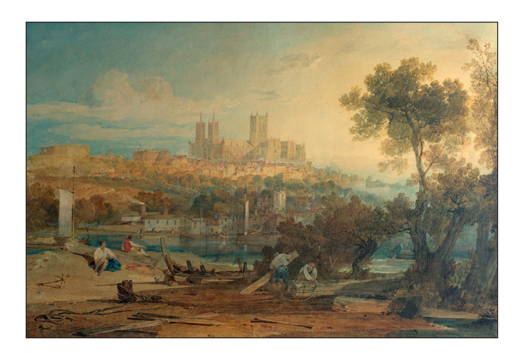
Figure 3: Lincoln Cathedral from the Holmes Commons. Painting: Joseph Mallord William Turner. Usher Art Gallery. Public domain (out of copyright) via Wikimedia Commons. Image from https://commons.wikimedia.org/wiki/File:Lincoln_Cathedral_from_the_Holmes_by_Joseph_Mallord_William_Turner.jpg [Last Accessed 10<sup>th</sup> May 2024].

The western border of the Brayford Pool as outlined in the Introduction appears to have not yielded archaeological evidence from the medieval period, although further west on Carholme Road there is evidence of industry and habitation (Lincolnshire County Council, 2024).