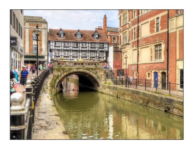
Figure 2: The High Bridge, Lincoln. Photo: David Dixon (5<sup>th</sup> August 2014). Image from https://commons.wikimedia.org/wiki/File:High_ Bridge,_Lincoln_(geograph_4114804).jpg [Last Accessed 10<sup>th</sup> June 2024]. Reproduced under the image license terms CC-BY SA 2.0.

net, 2009; Visit Lincoln, 2018a). It has also created a view that the 'uphill' area was, and still is, 'medieval' Lincoln and the medieval city did not stretch beyond this part of the city; yet, there are perceivable medieval buildings of note on the Brayford Pool, or close to it, along the Lower High Street (City of Lincoln Council, nd). The stone High Bridge is tucked away on the far east side of Brayford Pool and is the only medieval bridge in England that has houses built on it (Figure 2). The bridge itself was built in 1160 over the River Witham and the current Stokes Café building on it dates from 1540 (Visit Lincolnshire, 2023; Stokes Coffee, nd).