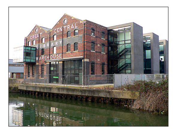
Figure 4: The Great Central Warehouse.

which is built around the original shell of the Engine Shed built by the Great Northern Railway in 1876 (City of Lincoln Council, 2008). Both sit next to a major railway crossing built in 1848, and just across from this is the East Holmes Signal Box, which is a well preserved signal box and distinctive within the landscape setting. This cluster of railway related activity means that the Industrial Revolution is within the perceptible realm and creates a landscape character that is distinctive and at the heart of university activities, thus shaping the focus of the historical and archaeological narratives of the area (Gobster et al., 2007; Gieseking et al., 2014).