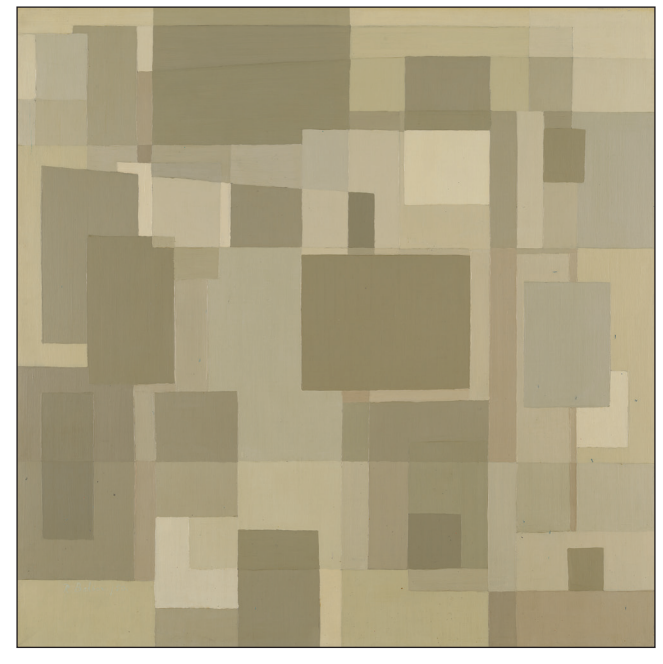
Figure 10: Ralph Balson (1950) Constructive Painting [oil on composition board, 122.0 × 121.4 cm], National Gallery of Victoria. © Ralph Balson Estate. Reproduced by permission of the copyright holder.

The techniques and conventions of Balson's everyday labour—laying-off, cutting in, glazing—provided adaptable methods for his abstractions. Yet the geometry of his forms, with their architectural relations, also evinces his labour. The shapes and spaces of the Constructive series are strikingly reminiscent of the houses that formed the sites of Balson's trade. In Balson's Constructive Painting of 1950 ( Figure 10 ), rectangles of varying dimensions and tones are arranged parallel and at slight angles to the picture plane, creating a sense of spatial depth. Painted in a reduced palette of beige, taupe, and warm grey, the colour scheme is evocative of the subdued wall colours popular for house interiors through the 1940s and early 50s. The shapes themselves are suggestive of the planes and apertures of the home; the wall surfaces and cornices, the windows and doors framed by architraves. Tonal variation in the superimposed rectilinear shapes also calls to mind the shadows and shifting light effects within a naturally illuminated interior over the course of a day.