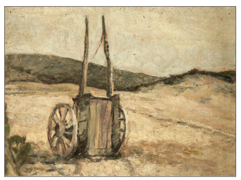
Figure 3: Ralph Balson (1930s) The Cart , [oil on board, 39.5 \times 49.5 cm]. © Ralph Balson Estate. Reproduced by permission of the copyright holder.

sketch clubs, Crowley remembered that 'These were things not done on the spot like the other students but subjects he had memorised going to work. All the week whilst house painting he would ponder his problems and realise them at week-ends when at last free to paint' (1966). Balson's day job clearly imposed restraints on his engagement with art, but also shaped the development of his style and subject matter. Indeed, Crowley was convinced of the benefits this had for his art making: