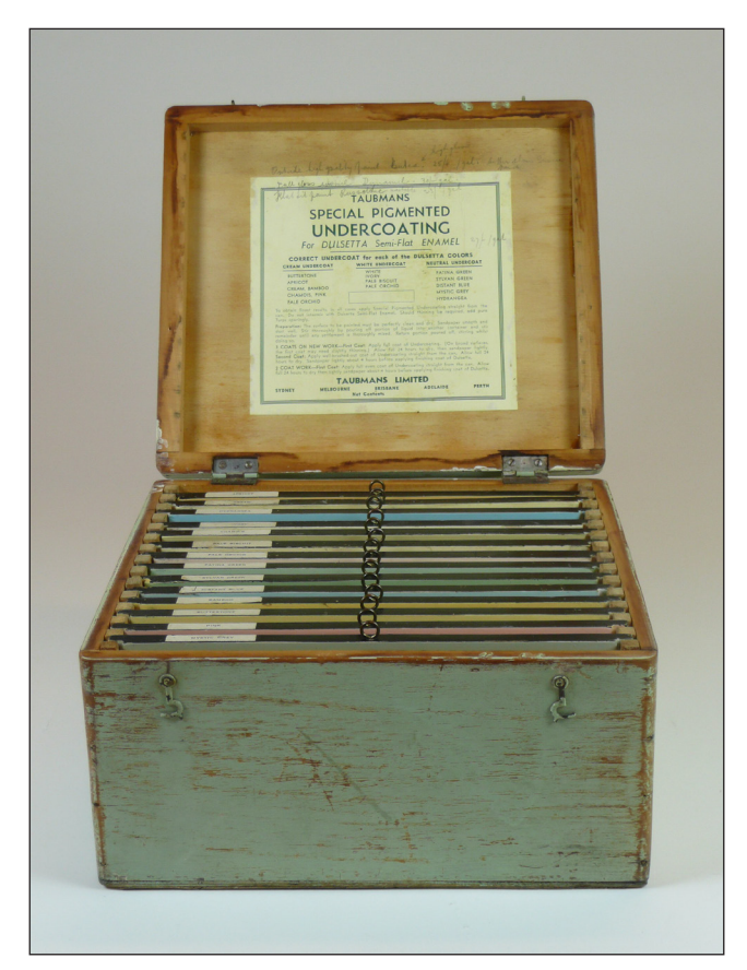
Figure 8: Paint Sample Set – Taubmans Dulsetta, Paint Samples, Top View.

was criticised as bordering on sterility, he was praised for his 'excellent colour sense and feeling for design' ( Sydney Morning Herald , 1941: 7). In fact, the pastel colours used liberally in Balson's Constructive paintings—particularly soft pinks and greens, pale blues, off-whites, and mushrooms—were popular house interior colours throughout the 1940s until their replacement in the 1950s by hues of greater intensity and vibrancy (Cuffley, 2007: 191). The Taubmans 'Dulsetta' semi flat enamel paint sample set, held in the collection of Museums Victoria ( Figure 8 ), reveals the potential influence of contemporary interior colour schemes on Balson's artistic palette. The sample set, produced in the late 1940s or early 50s, was distributed by Taubmans' retail branches, including a location in Sydney, for the use of tradespeople and interior decorators. Representative of the temperate colours of the 40s, the samples are composed of soft pastels in blue, pink, green and cream. Indeed, Balson's Painting (1941; Figure 9 ) approximates many of the colours in the swatch set: apricot, ivory, cream, hydrangea, and pale orchid. In this sense, Balson likely selected and combined the domestic colours he was familiar with through his trade into a broader artistic palette.