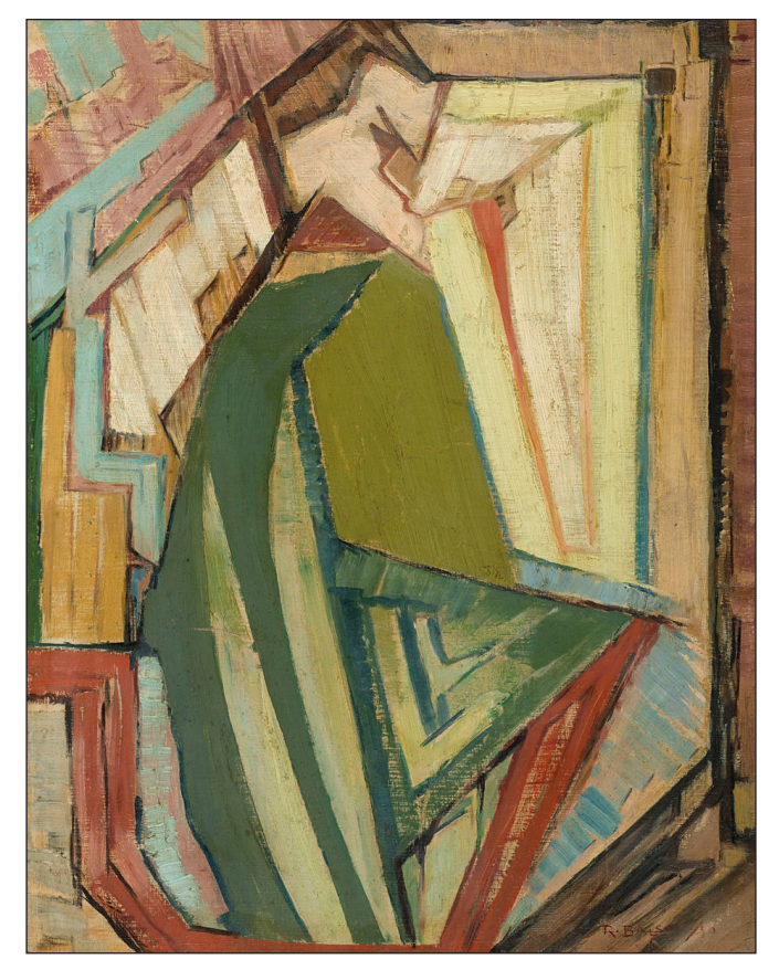
Figure 4: Ralph Balson (1939), Semi-Abstraction: Woman in Green [oil on cardboard, 63.5 × 48 cm], private collection. © Ralph Balson Estate. Reproduced by permission of the copyright holder.

colours and shapes. The folds of fabric down the curve of the back have been gathered into chalky green and white verticals, the upper arm massed into an olive polyhedron, and the leg divided into projecting green triangle and acute red angle. On either side of the figure, light and space are rendered as fragmented, shifting planes. To the right, they are arranged in orderly, vertical stripes, while on the left, diagonal brushstrokes of powdery blue and bruised pink, suggest the angle of light, or the brilliance of sky through a window. The busy contrasts of cool and warm hues—blue and pink, green and yellow, red and grey—are restless and energetic, radiating outward from the figure like an aura. The articulation of light, space, and form through angular, unblended brush strokes emphasises the flatness of the picture plane and the material reality of the paint applied to it. In its semi-figuration abstracted from nature, Woman in Green realised the progressive ambitions of Sydney painters in the late 1930s. Indeed, the work was included in Exhibition I , a group exhibition of work by Frank Hinder, Crowley, Fizelle, and Balson that was intended as the first in a series of shows announcing abstract art in Sydney, and offering, as modernist Eleonore Lange (1939) put it, 'a new realm of visual experience'.