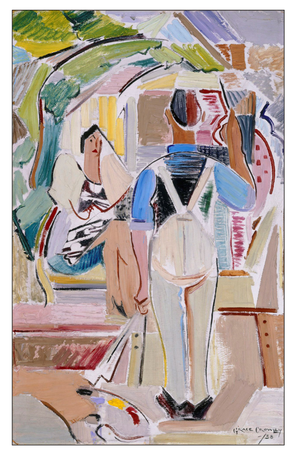
Figure 5: Grace Crowley (1938) The Artist and His Model [oil on hardboard, 86.0 × 54.0 cm], Art Gallery of NSW. © Grace Crowley Estate. Reproduced by permission of the copyright holder.

Balson and Crowley painted portraits of each other, offering insights into their shared artistic influences and class differences. Crowley's The Artist and his Model of 1938 ( Figure 5 ) depicts Balson at the easel in the rooftop garden of the George St studios, painting his subject. His canvas bears only a vague resemblance to the scene before it, showing him seeking out its abstract values in the manner taught at the Fizelle–Crowley School. Balson is wearing the apparel of his trade: a flat cap, blue–collared shirt, and black waistcoat under white painter's overalls. The hue of the painter's raised arm and nape is decidedly darker than the model's. While this may be formal experimentation, it nonetheless suggests the manual and often outdoor aspects of Balson's work. The model, by contrast, is an urban sophisticate. Wearing high heel shoes, a slim dress in a bold print, and hair cut in a fashionable bob, she is representative of the city's à la mode art scene. The painting's title is also instructive, marking Balson out as the artist and not one of Crowley's students from the Sydney Art School. At the same time, the description of the sitter as a model depersonalises the artwork in a manner consistent