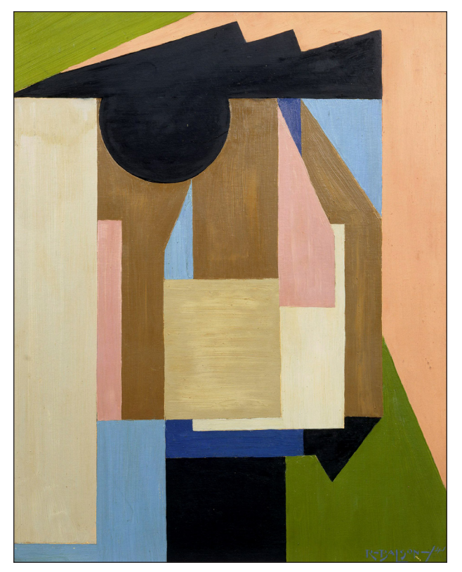
Figure 9: Ralph Balson (1941) Painting [oil on cardboard, 79 × 63.5 cm], Art Gallery of NSW. © Ralph Balson Estate. Reproduced by permission of the copyright holder.

The painter's trade also informs Balson's technique and paint handling. The Painter's and Decorator's Guide , a mid-century manual for apprentices in Australia, prized smoothness and 'even pressure and uniformity' (Wallis, 1947). Such impersonal characteristics are evident in Balson's Constructive works and perhaps explain the lukewarm reception of the 1941 exhibition and the charge of 'sterility'. More recent discussion has noted Balson's 'elision of the brushstroke, his choice of smooth paperboard surface and his confidently hand-wrought geometric forms [that] demonstrate skills he developed painting houses' (Slade, 2013: 290). Balson's deft and precise paint application is not in question; however, his brushstrokes are not, in fact, elided. Bristle marks are visible in many paintings in the Constructive series: even and consistent, these marks follow the direction of forms, moving vertically with tall rectangles, horizontally with shapes laid width-ways, around circles, and diagonally with triangles. Creating subtle striations that catch the light, these uniform marks also make a virtue of the painter's steady hand in laying-off or dragging paint.