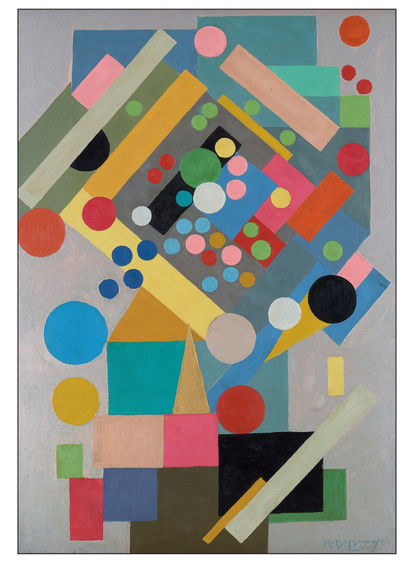
Figure 7: Ralph Balson (1941) Painting no. 17 [oil and metallic paint on cardboard, 91.7 × 64.8 cm], Hassall Collection. © Ralph Balson Estate. Reproduced by permission of the copyright holder.

Balson's 1941 solo exhibition at Anthony Hordern's Gallery was the first public presentation of his Constructive paintings and, significantly, considering Balson's outsider class status, the first solo exhibition in Sydney of purely abstract, or non-objective art ( Truth , 1941: 32). The works in the exhibition explored colour relationships through opaque, superimposed geometric forms in a palette of mint green, dirty pink, baby blue, ochre, brown, grey, and metallic accents of silver, gold and bronze ( Figure 7 ). Black was used sparingly to create void-like spaces. Balson favoured solid verticals, right-angle triangles, full circles, half rounds, and rectilinear shapes, sometimes resulting in architectonic compositions. Vertical shapes contrast with diagonal lines to create compositional tension, horizontal lines establish harmony, and floating circular forms animate the surface. While the focus is on flatness and the two-dimensionality of the picture plane, the works maintain a painterly quality: the artist's hand is evident in deliberate brushstrokes, visible bristle lines, built-up passages, and smudged tape lines.