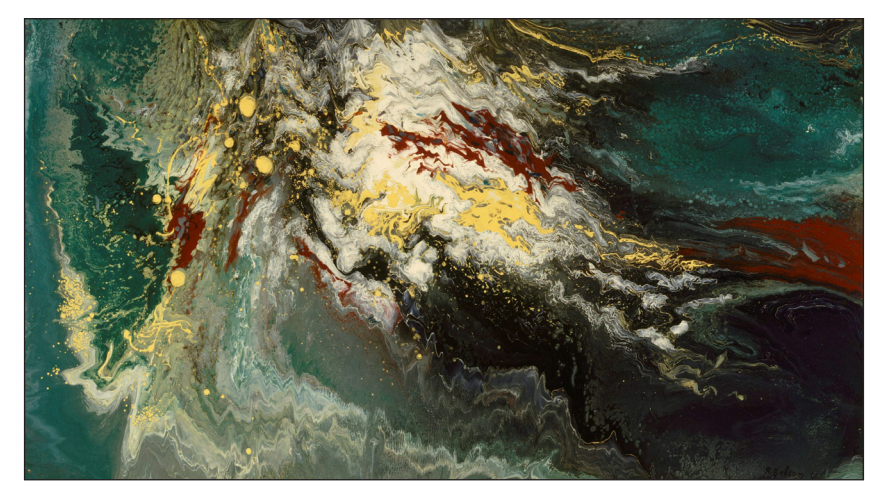
Figure 11: Ralph Balson (1961) Matter Painting [synthetic polymer paint on hardboard, 76.4 × 137.3 cm], Art Gallery of NSW. © Ralph Balson Estate. Reproduced by permission of the copyright holder.

of physics. As he put it, 'the matter, the paint, was allowed to flow together to produce its own rhythm, its own structure – a natural paint structure' (Balson, 1962). Spilling, dripping, and splashing paint, allowing it to eddy and pool, Balson worked with the forces of gravity and entropy. In Matter Painting of 1961 ( Figure 11 ), black, deep seagreen, yellow, blood-red, and white are agitated into wave-like streaks. In some places, the colours seem to run and marble, in others, they coagulate into opaque masses. The composition and colour harmonies are created from the texture and fluidity of the paint which is allowed to conduct itself across the surface without the intervention of the brush. In these works, Balson shares creative agency with the very material he had laboured to control in his career as a house painter.